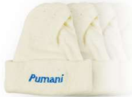
Pumani Hat, Size - Medium