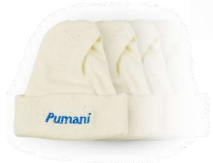
Pumani Hat, Size - Large