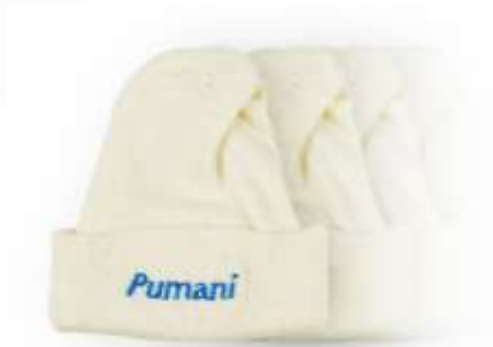
Pumani Hat, Size - Small