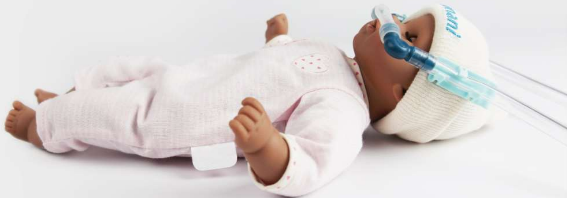
Pumani Nasal Prong Size Selection Chart